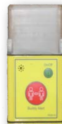
Personal Detection Device (PDD)