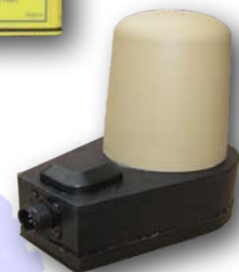
MagMount Omni Head Unit (OHU)