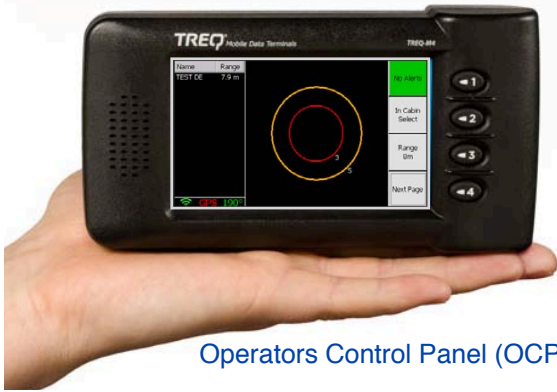
Operators Control Panel (OCP)