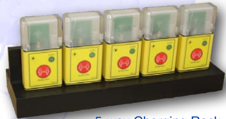
5-way Charging Rack

To cater for varying Vehicle sizes, each Vehicle can have its own unique zone settings configured. The system also caters for persons wearing PDD's inside the Cabin and has a 'Buddy Alert™' feature allowing workers to raise a global alarm.